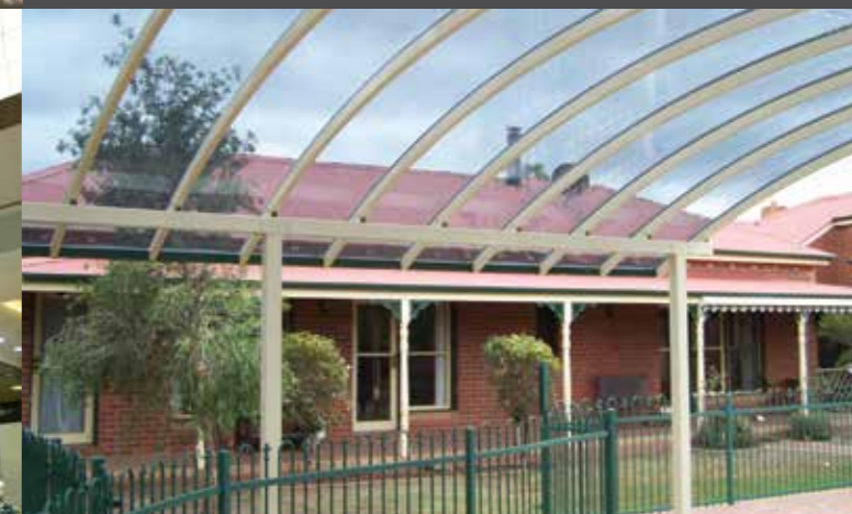
Residential, Danpal® Compact, Sydney Australia