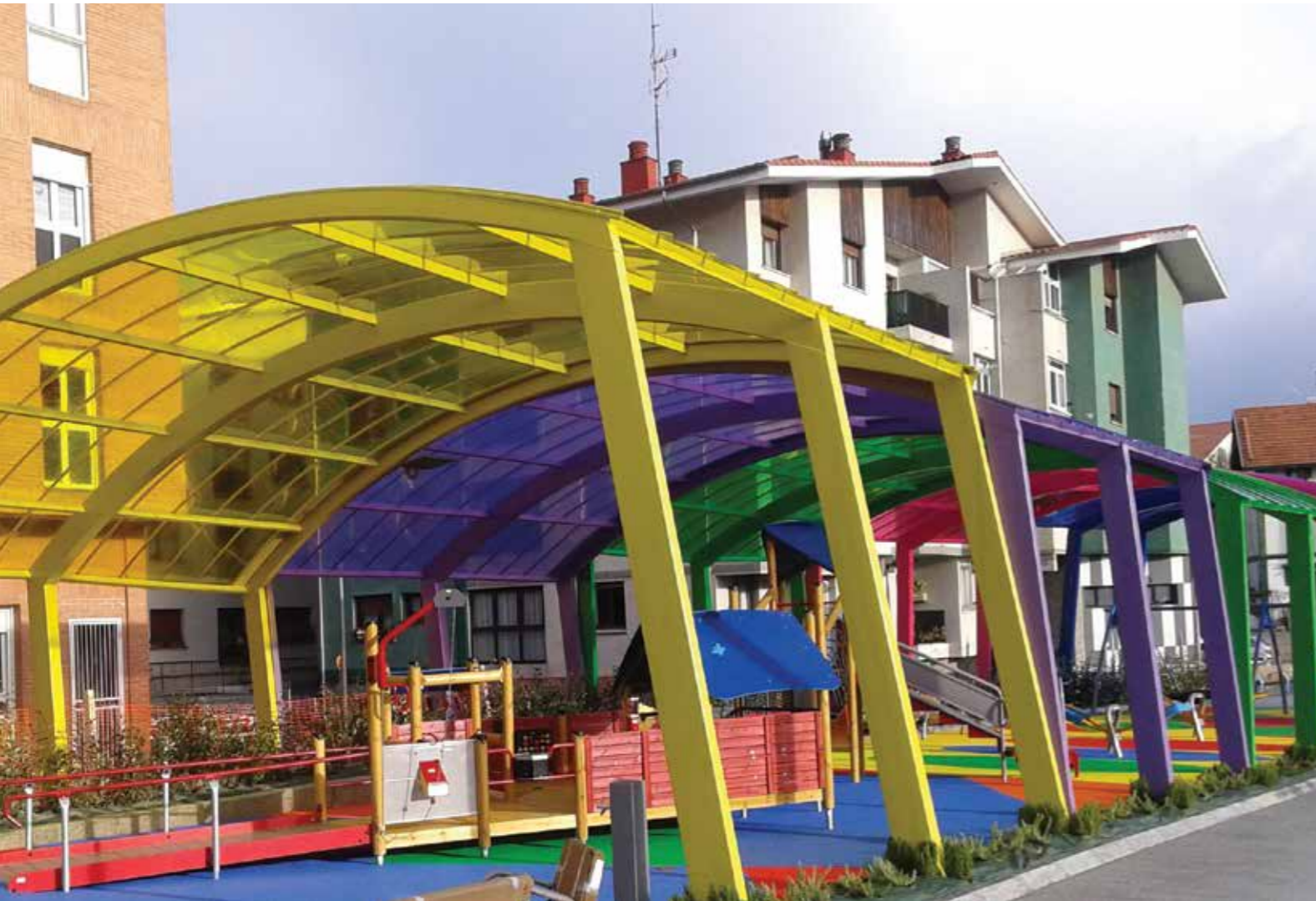
Playground, Spain | Danpal® Compact | Architect: Kepa Sacristan

Aluminium or polycarbonate connectors offer architects a high degree of freedom in terms of exterior building design. Up to 12.0m long panels are supplied and are available as straight panels, cold bent, or thermoformed to form tight curves. Danpal® Compact is available in all color ranges - easily adapting to all creative transparency ideas.