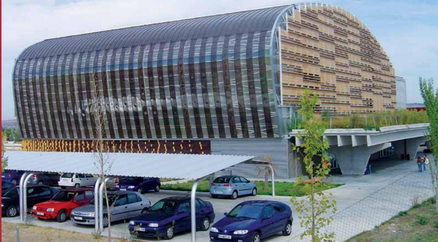
Office Building, Spain | Danpal® Compact | Architect: Pich Aguilera