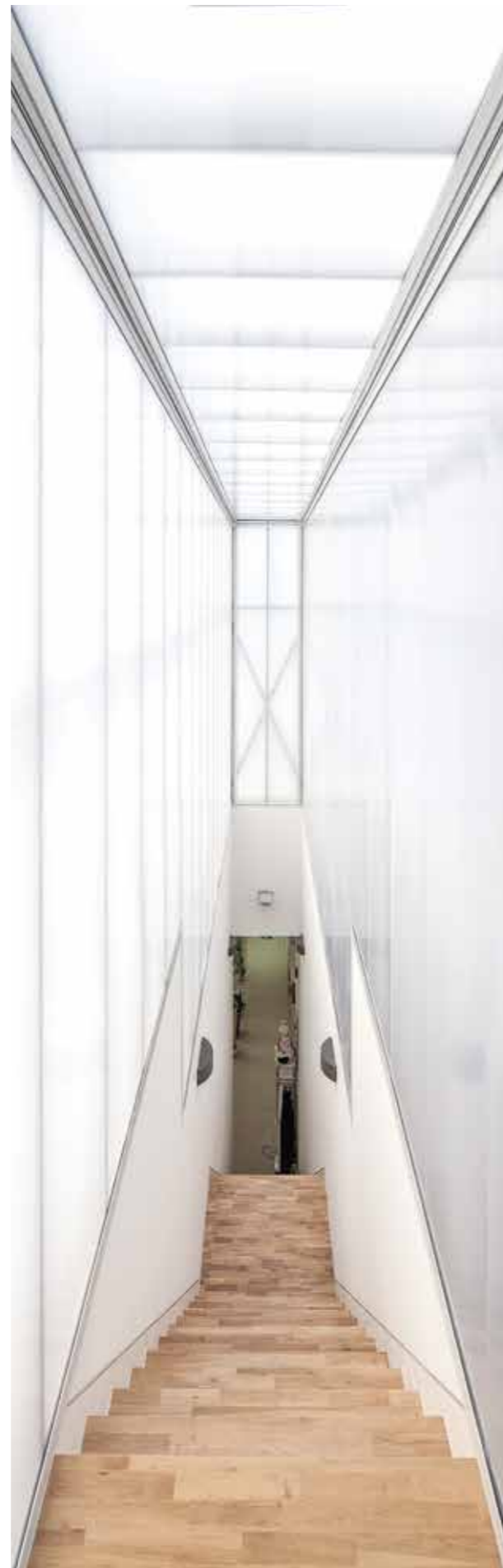
Seosan Hori Neighborhood Facilities, Korea | Danpal® Interior Partitions System 10mm, Architect: Cornerstone Thing Chusa