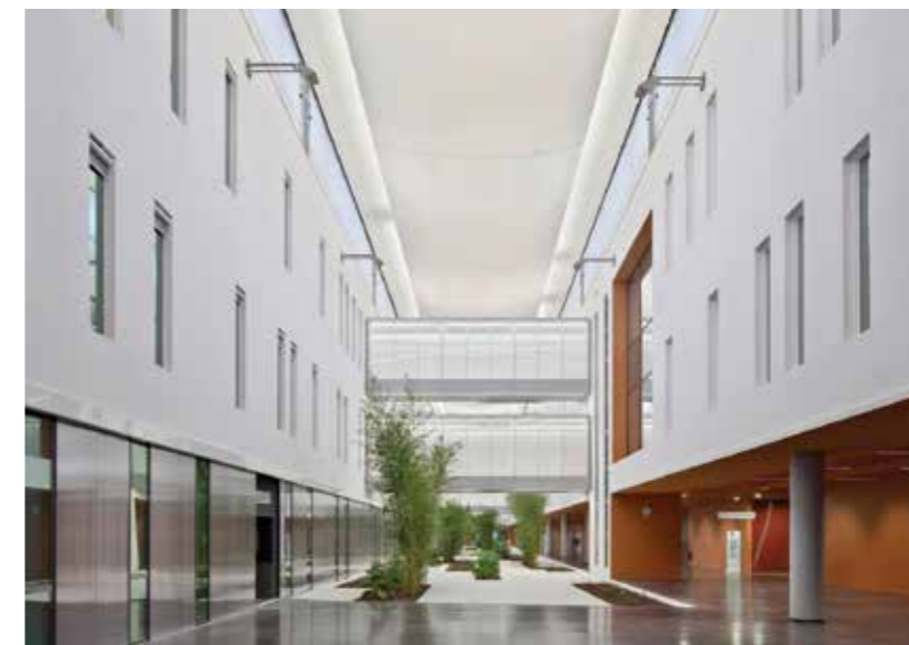
Corporate Offices, France | Danpal® Interior Partitions System 16mm