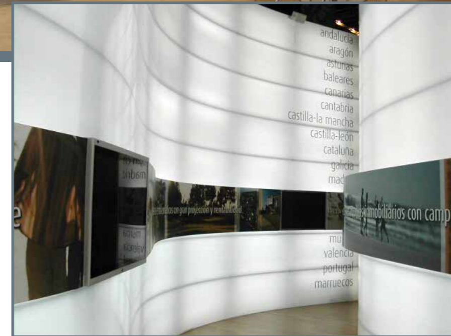
Dauphine University, France Danpal® Interior Partitions System 16mm Architect: SCP Beguin & Macchini, D.E.N.S.A.I.S Architectes