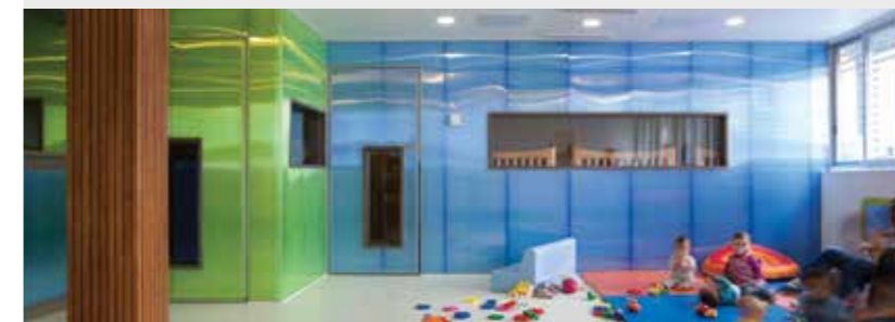
Creche the Mill Budding Paris, France | Danpal® Interior Partitions System 10mm Architect: Pablo Katz Architecture