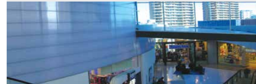
Westfield Shopping Center, Australia | Danpal® Interior Partitions System 16mm